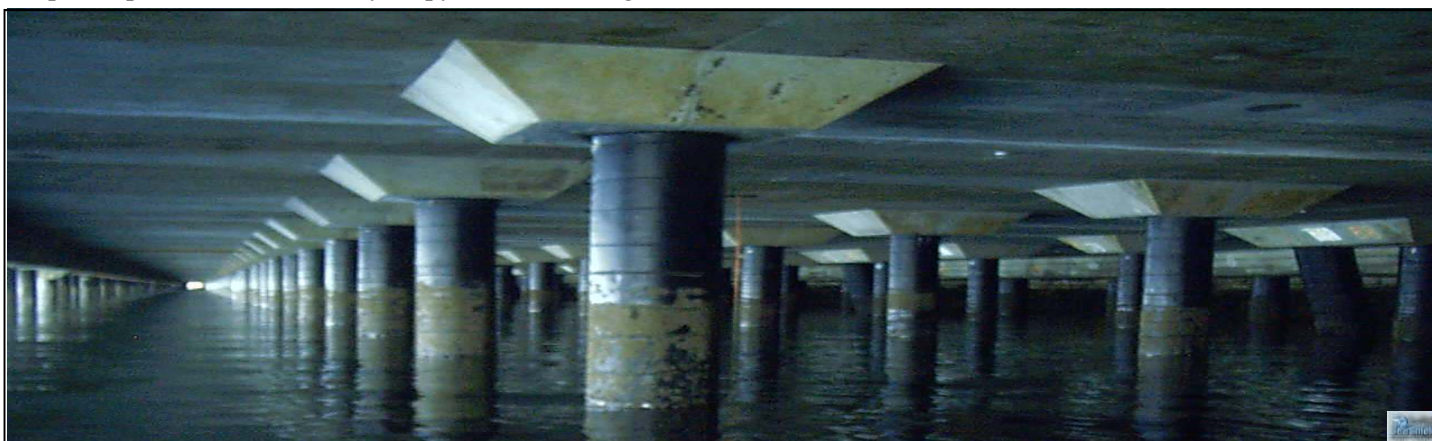
Figure 1. Complete Series 100 System on cylindrical piling ▲

Used by yacht clubs on marinas and mooring berths. By road authorities on bridges and jetties. By local councils on bridges jetties and piers. By refineries, bulk commodities handlers and port authorities on loading wharfs, jetties, dolphins, piers and beacons. By shipyards on loading wharfs.