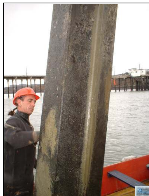
Figure 2. Cleaned pile showing the application of primer down either side of a vertical weld seam and into pits. Shown is a hexagonal pile. The procedure is the same for cylindrical and universal piles.