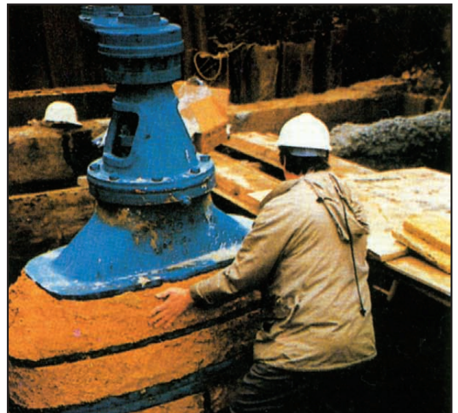
Densyl Super Light Profiling Mastic