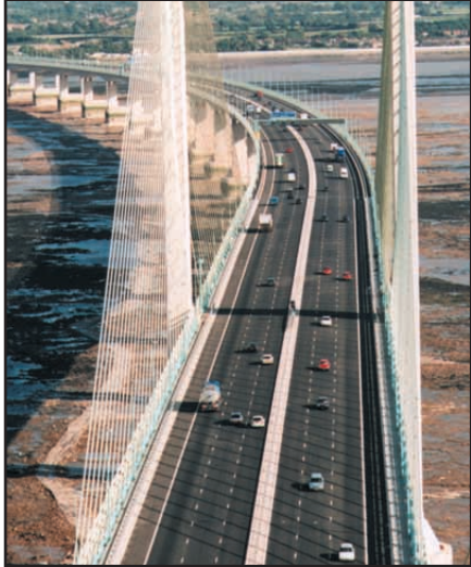
Bridge stay cables.

Special pumping equipment and heated storage tanks are available for hire or purchase.