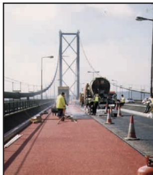
Roads and bridges.