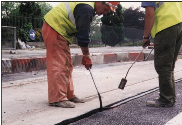
Tramways and light railway.