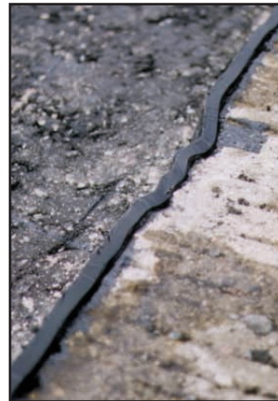
Tough and conformable bond.