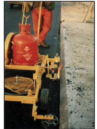
Application by machine.