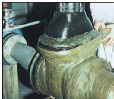
Overwrapping with Denso Tape