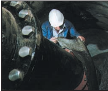
Application: Mastic Blanket on flange...

Spirally apply tape with a 55% overlap. Care should be taken to ensure that tape is in contact with the underlying surface to prevent wrinkles or air pockets. On flanges, couplings, and fittings, wrapping with Densoclad Tapes should be on a reducing diameter/circumference.