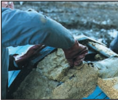
Application: Profiling Mastic on Tybar...