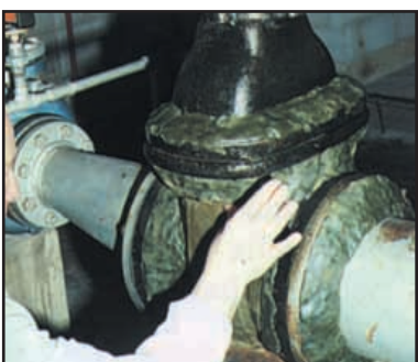
Profiling with Densyl Mastic.