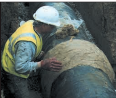
Application: Profiling Mastic on flange...