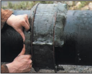
Profiling and infilling with Densyl Mastic.