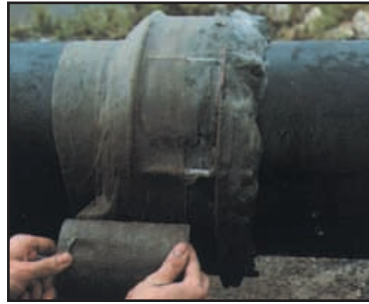
Overwrapping with Denso Tape