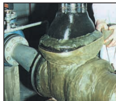
Overwrapping with Denso Tape