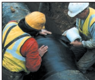
being overwrapped with Densoclad Tape...