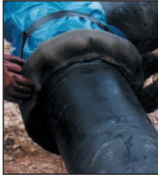
Densyl Mastic Blankets

Self-supporting and non-cracking, Denso Pipeline Mastics remain permanently plastic whilst being impervious to moisture. They are highly resistant to mineral acids, alkalis, salts and mechanical stress over a wide temperature range. These characteristics give the products great versatility. Used prior to the application of Denso or Densoclad Tape, the products are ideal for building up contours on mechanical pipe joints, valves, bolted flanged joints, etc. Should it be necessary at any time to examine, modify or repair the items so sealed, the Mastics can be easily removed and re-used if required provided the product has not been contaminated.