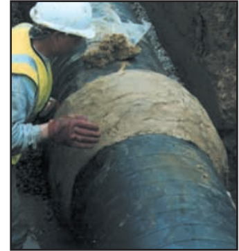
Denso Profiling Mastic.