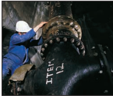
being overwrapped with Denso Tape...