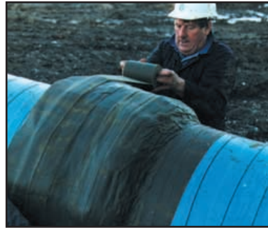
being overwrapped with Denso Tape...