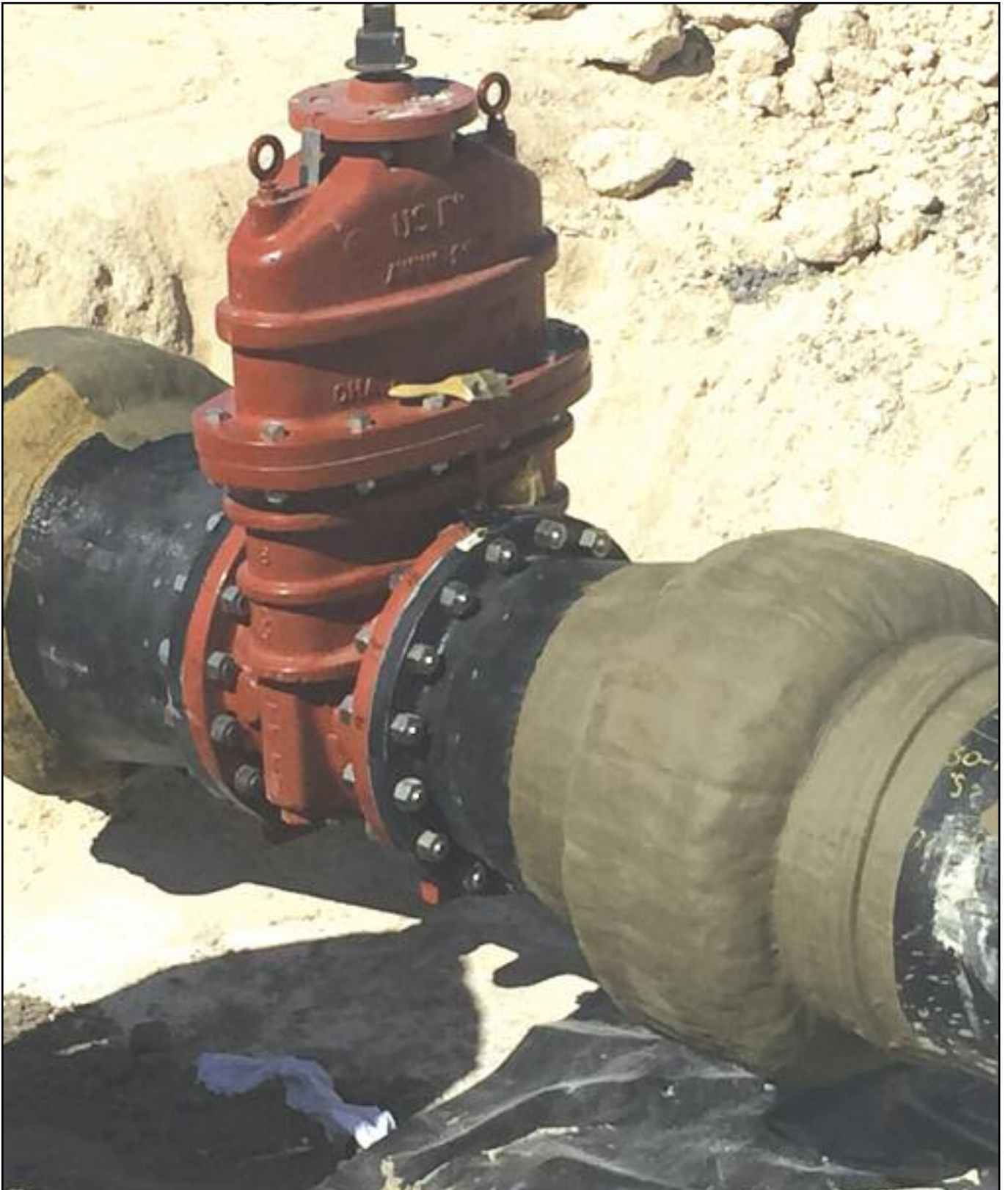
Application of the Densyl Tape which was cut into strips over the Profiling Mastic on the flanges.

LEADERS IN CORROSION PREVENTION & SEALING TECHNOLOGY