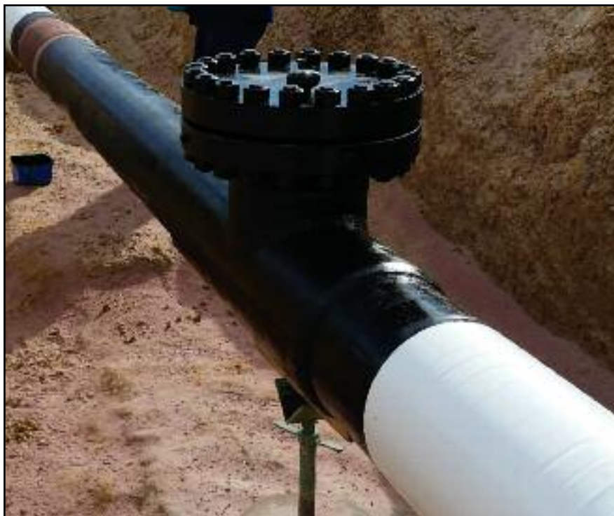
Protection of a joint and tie-in to existing coating underway.