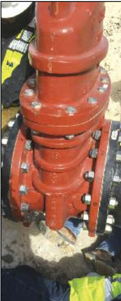
The surface was prepared in accordance to SSPC SP-2/SSPC SP-3 prior to application of the Denso Paste.

the success of this application only added to the confidence of engineers and contractors that the system will provide the long term corrosion protection they desire.