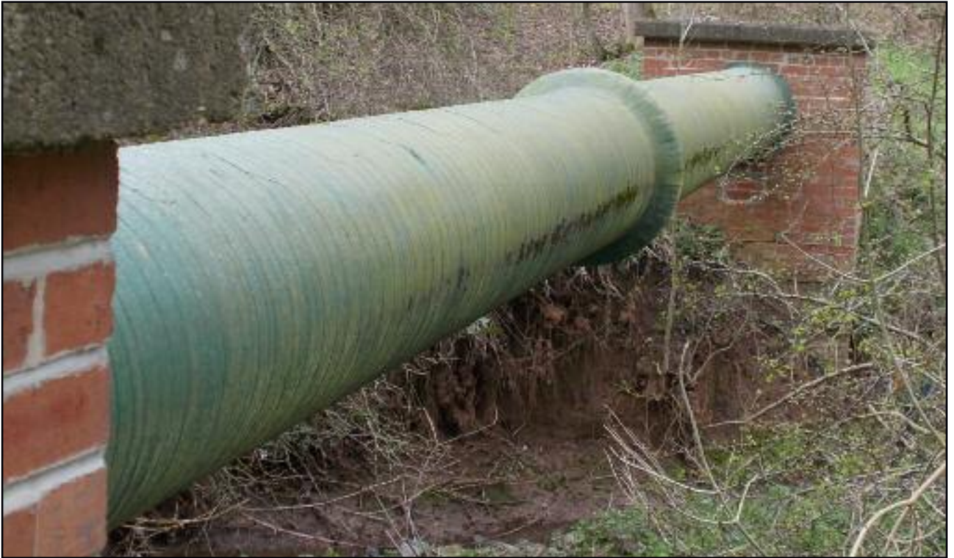
Above: The original 2005 applied Steelcoat 400/100 System. The photo was taken in 2016 showing a little moss and dirt accumulation as to be expected.

LEADERS IN CORROSION PREVENTION & SEALING TECHNOLOGY