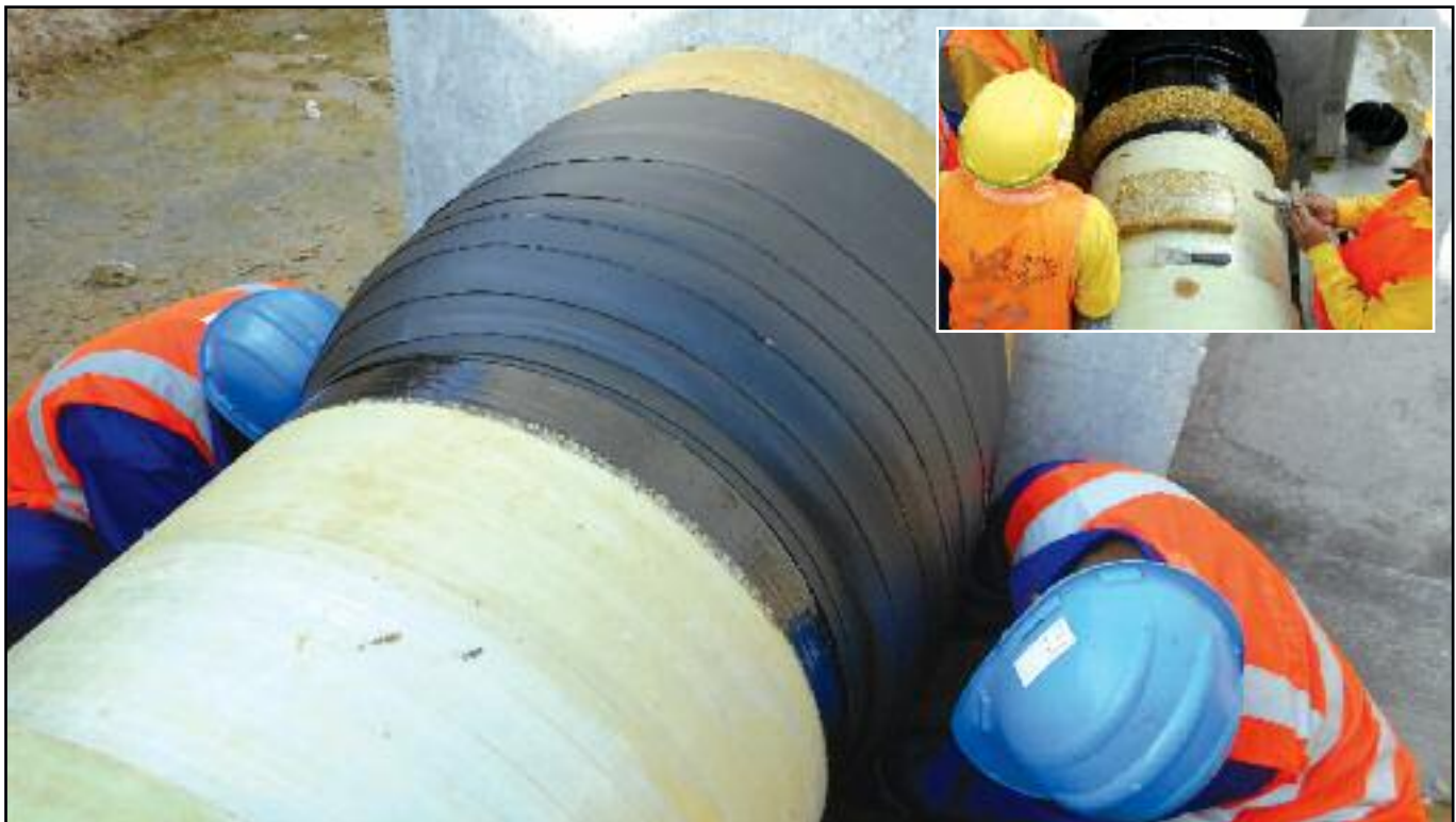
A circumferential wrap of Premcote 1500 Tape completes the protection. Inset shows Premier Joint Moulding putty used to smooth profiles.