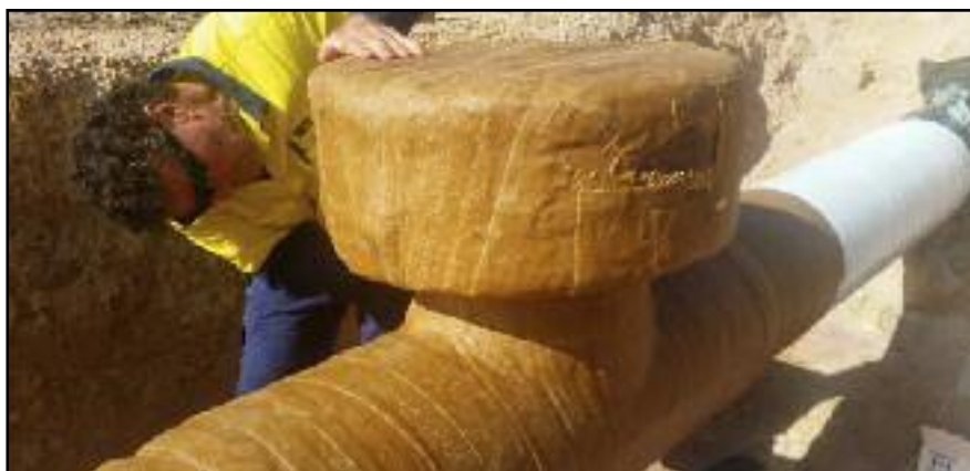
Application of the Denso Petrolatum Tape System.

APA personnel on-site were highly knowledgeable with the Denso range of products and required very little training during application and the project was completed on the same day without any issues.