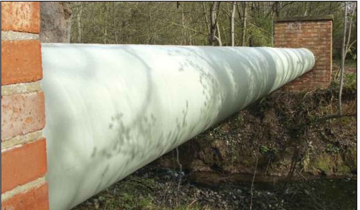
Below: The completed 2016 Steelcoat 400/100 System in sage green finish.