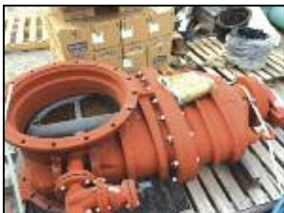
A new valve ready for installation.

Though the project continues to be controversial, it is one that