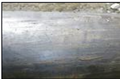
The pipe still in perfect condition - immediately after the removal of the original Denso system and still showing a layer of petrolatum compound.

The entire coating system was removed and the pipe surface was cleaned. No corrosion whatsoever was evident after 28 years since its installation in 1988. The inspections reflected an excellent coating system