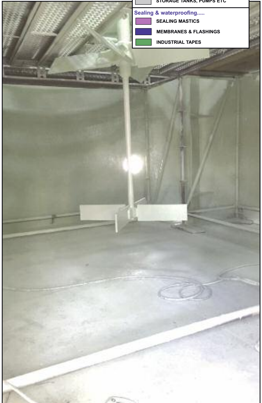
The Cristal mixer tank lined with Archco-Rigidon 403D by Hertel (UK).