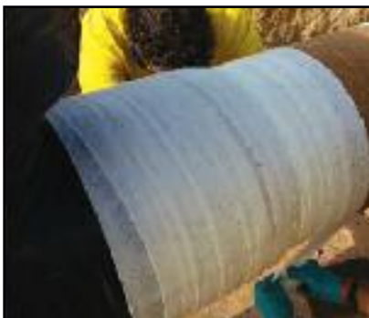
Application of the Glass Outerwrap System.

APA personnel on-site were highly knowledgeable with the Denso range of products and required very little training during application and the project was completed on the same day without any issues.