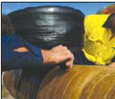
Application of the SA PVC Tape.