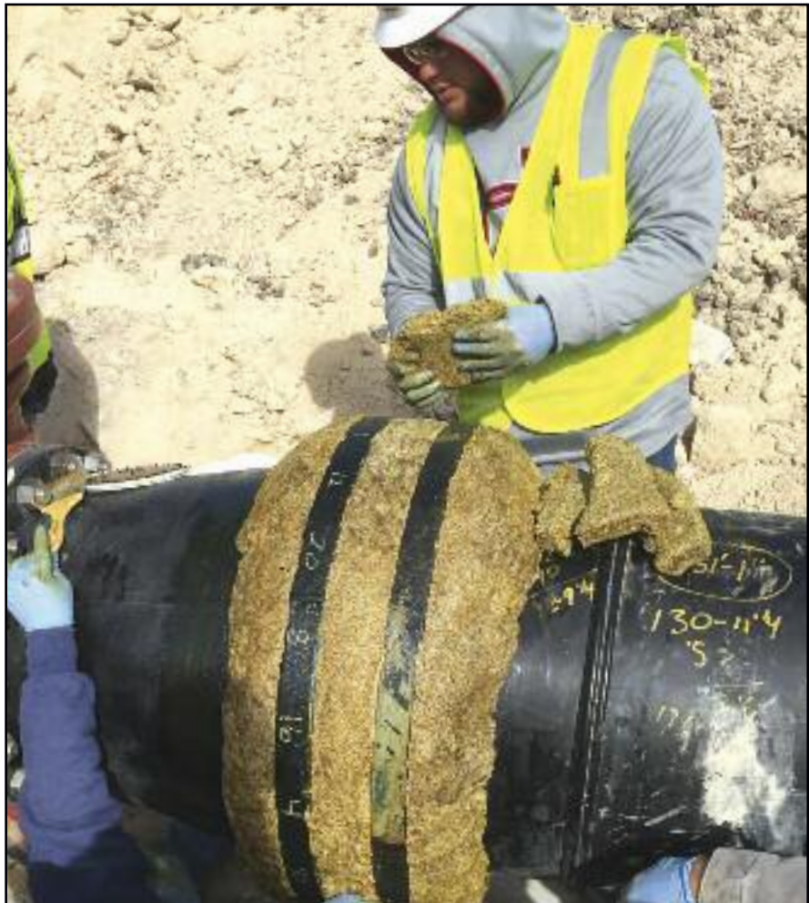
Application of the Denso Profiling Mastic creating a smooth profile for the Densyl Tape.