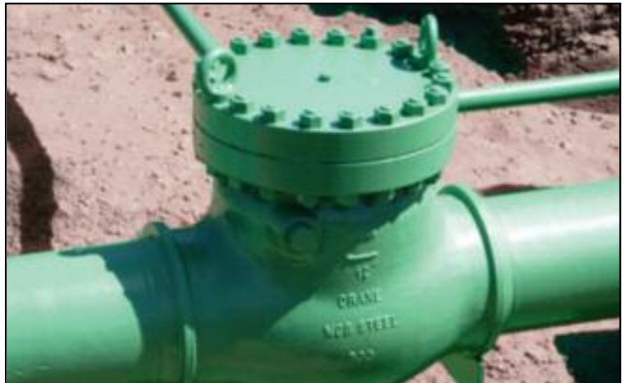
Pictures: All steel parts of the valve stations were protected with Protal 7200.

The Project saw the supply of over 5,000 Litres of Protal 7200