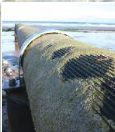
Above: Damage to the cement mortar on the Jurby outfall pipe.

In early October a further inspection indicated that erosion of the outfall had been checked.