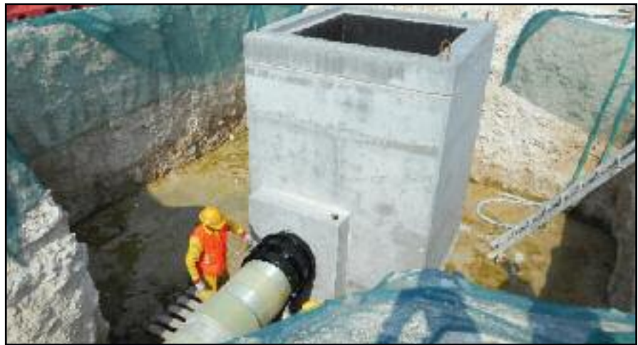
Above: After cleaning, the coupling is primed with Premcote Primer.

Country: Qatar Object: Steel couplings Problem: Corrosion prevention Product solution: Premier Premcote Tape System