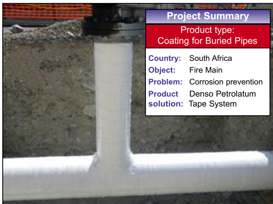
The new tie in, also wrapped in the same Denso Petrolatum Tape System used in 1988.