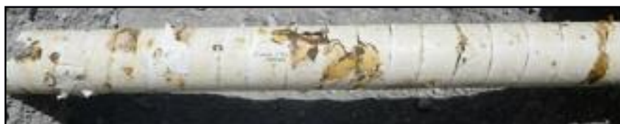
The original outer wrap damage was partly caused by the backfills and recent excavation.

Anglo American Platinum is the world's leading primary producer of Platinum Group Metals (PGMs). They provide a complete resource-to-market service, supplying their network of global customers with a range of mined, recycled and traded products.