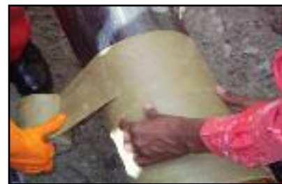
After cleaning, the pipe was re-coated with the Denso Petrolatum Tape System using a 55% overlap of the tape.