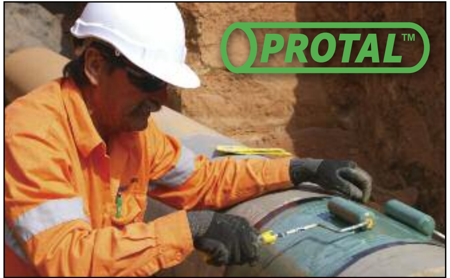
Above & below: Denso Protal 7200 being applied to protect the gas main field joints.

Nevertheless, construction continued and saw the coating of more than 8,000 mainline field joints, applying Australian manufactured Protal 7200. The epoxy was supplied in 800 litre kits to be utilised with SCL JV's three purpose-built coating rigs. These comprised of plural pumps and generators for spray application of the Protal 7200.