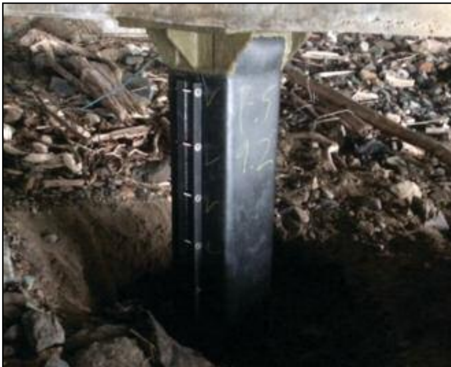
Above: Pile cap/gusset area protected with the SeaShield SplashZone UW Epoxy.

The SeaShield Series 2000HD System will provide 20+ years of corrosion protection in this harsh environment that encounters over 20 feet of tidal fluctuation. The project was completed in the early Spring of 2016 under budget and ahead of schedule. All parties, including the Contractor, Design Engineer and City of Juneau were very pleased with the project.