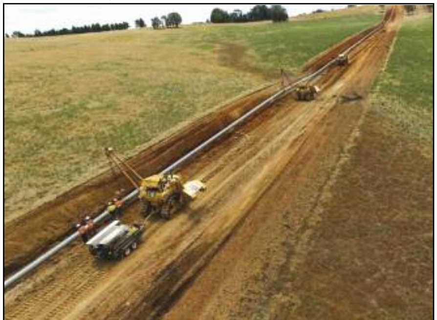
A section of the new gas main under construction.

Queensland Gas Pipeline (QGP) Looping project and the QCLNG Northern Trunklines project has spanned some 550km throughout Australia. It has seen SCL apply nearly 60,000 litres of Protal 7200 during a 36 month period.