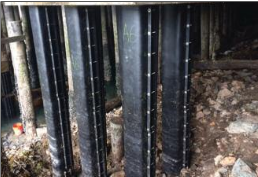
Completed H-Piles fully protected with the SeaShield Series 2000HD System.

After hand power tool cleaning surface preparation, the Dive Contractor applied Denso S105 paste, Foam Blocks wrapped with Densyl Tape, a final Densyl Tape wrap with a 55% overlap and the Series 2000HD Outercover (80 mil HDPE) to the pile's splash-zone area. In addition to these piles, there were several piles that had cross bracing and node areas, which received the Denso Glass Outercover UV in lieu of the 80