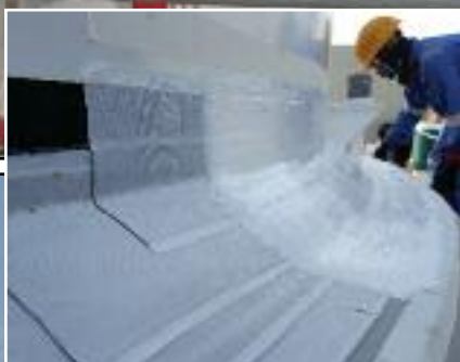
Above: Denso Acrylic Topcoat is applied over the layer of Denso Ultraseal RT.

After discussions with the consultants MUC, BPGIC approved the use of the Denso Steelcoat Tank Base Protection System™ for all their tanks on their new Fujairah storage facilities terminal. This approval was based on the successful record of the Denso system being used by other tank farm operators in Fujairah. The Denso protective system was applied by contractors Audex. The project was completed in March 2017.