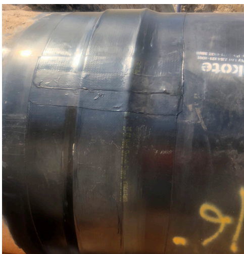
Premier Heat Shrink Sleeve 30 ST™ and Densopol 60™ Tape applied to the Darwin River pump station pipe.