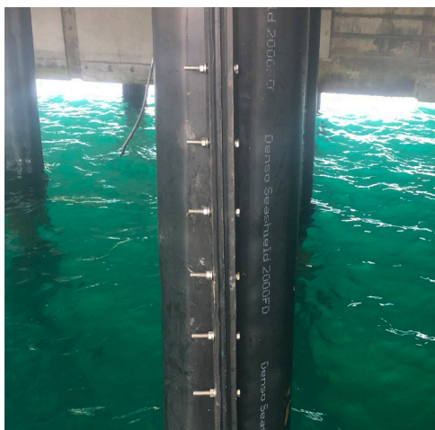
SeaShield 2000FD jacket on pile above water