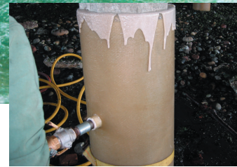
SeaShield™ 550 Epoxy Grout being pumped into the SeaShield™ Series 500 Fiber-Form Jacket.