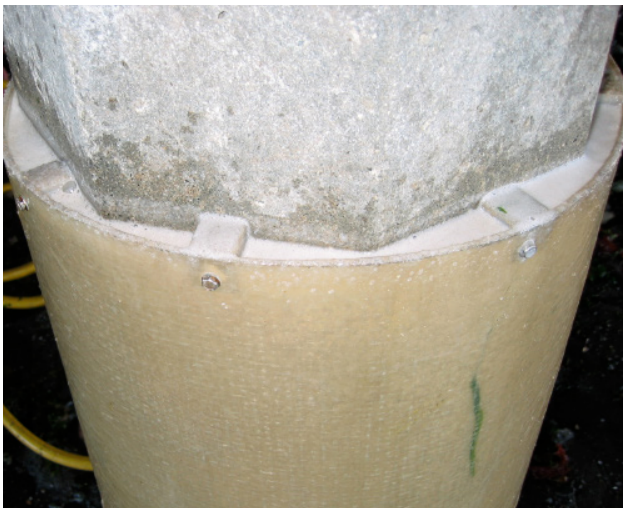
SeaShield™ 550 Epoxy grout pumped into the annulus around an existing octagonal concrete pile.