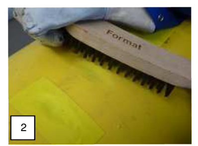
Clean and roughen the surface with a hand wire brush.