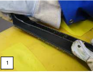
Remove any non-adherent factory coating and chamfer sharp edges with a rasp (semi-circular blade)