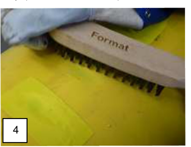
Roughen again the warmed factory coating.