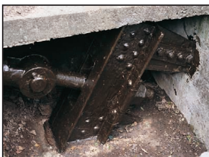
Hi-Tack Primer and Tape applied to badly pitted steelwork.

adhesive aluminium tape (Denso Sirex Tape) provides an ideal final protective seal .