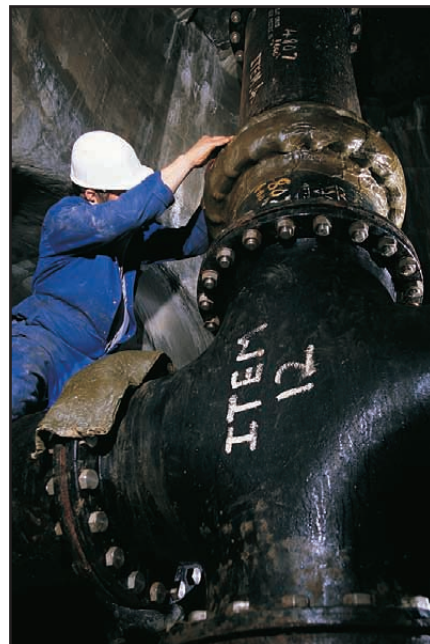
Sealing and wrapping flanges on damp pipes in a continuously humid environment.

For damp/low temperature pipework pipe surfaces are first primed with SeaShield Primer P. A mastic with additional insulation properties (Denso Superlight Profiling Mastic) is utilised to seal flanges and voids prior to tape wrapping. An optional