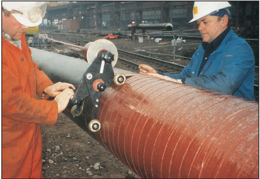
Fast Densoman Machine application of Denso Hotline Tape.

Denso Steelcoat 200 System comprises a plastic backed petrolatum tape (Denso Hotline Tape) and a high temperature mastic for sealing fittings and awkward shapes (Densoseal 16A). No primer is required.